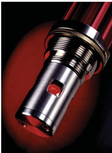
Optional 316 SS sensor housing for applications with high corrosives

A number of different corrosion resistant mirror and sensor housing materials are available, to withstand aggressive sample components in the harshest of applications. High temperature (up to 130°C) and high pressure (up to 250 barg) sensor versions are available. Michell's technical team are always available to advise on the most appropriate choices for your process.