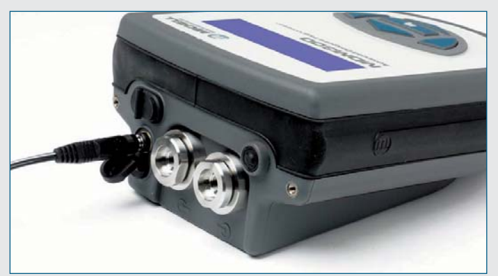
Measurement in hazardous areas

The MDM300 series offers versatile sampling arrangements ranging from simple fixed orifices for low pressure measurement to configurable high-pressure sampling systems up to 350 barg (5076 psi). A number of application kits are available providing out of the box sampling systems specifically for the most popular applications. Please contact Michell Instruments for further details.